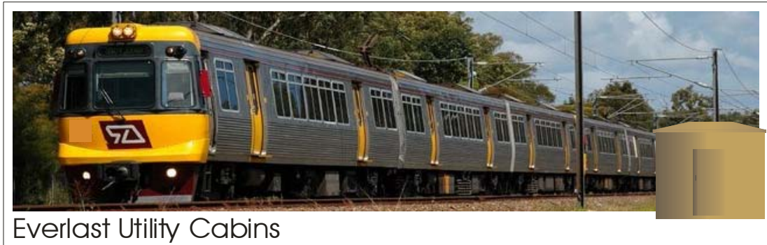
Everlast Utility Cabins