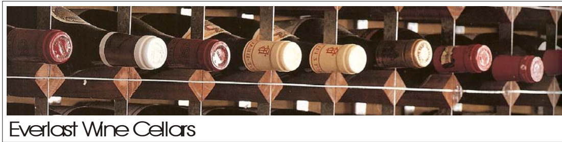
Everlast Wine Cellars